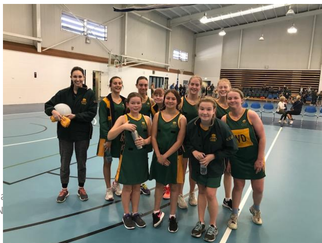
Pa Senior N